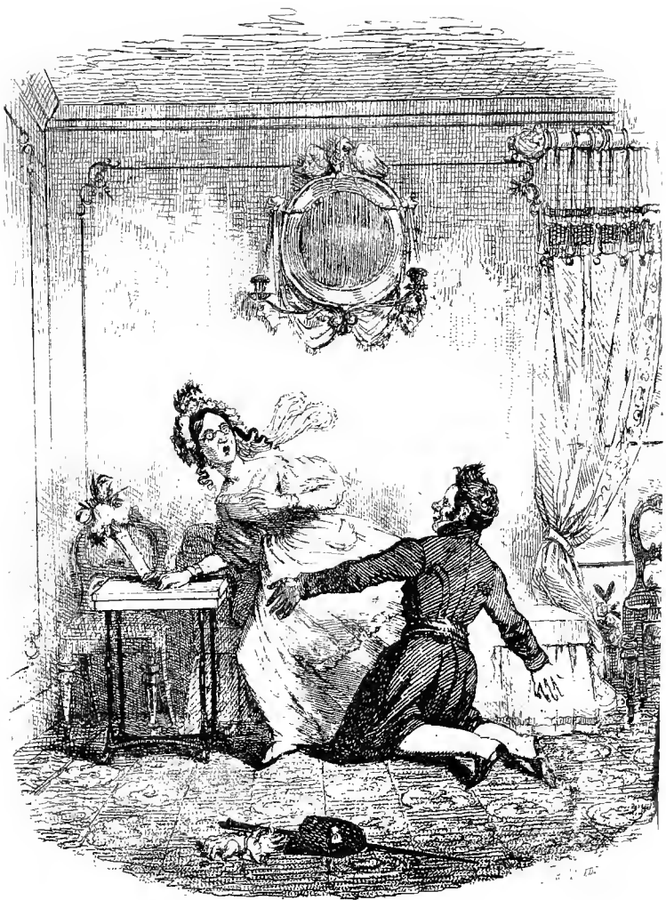
Fiacraft's surprising declaration.